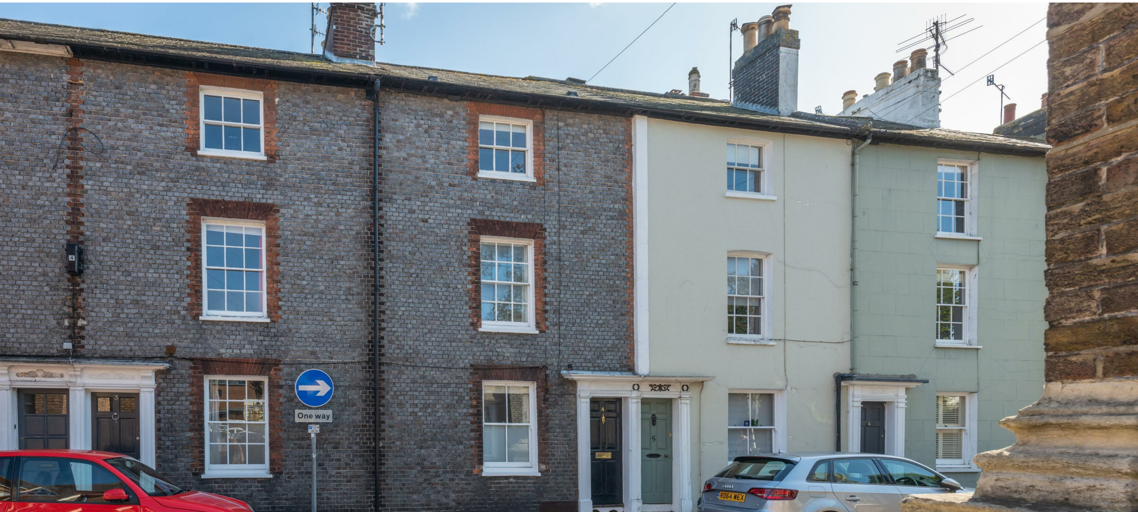
Friars Walk, Lewes